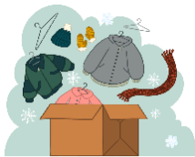
Coats for Kids

Last call for our parking lot building affectionately known as the “Deer Stand!” It would be a great deer stand, she shed, playhouse – you name it! The 8’2” x 5’6” building can be used as is or sit on the ground without the scaffolding. The entire structure is 12’ high, with the building itself being 8’ high. Moving of the structure is not included. Bids will be accepted through October 25, 2023. Please submit bids to the office via email office@standrewsoshkosh.org or call 920-235-6616. Thank you!