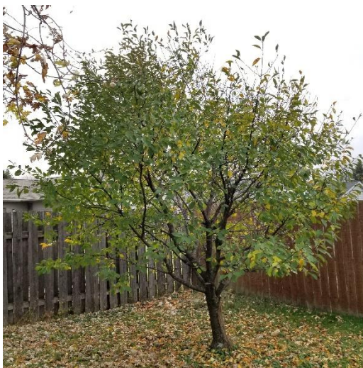
My Cherry tree!

Today I took a photo of it – it is holding onto green leaves, proudly has a full head of leaves when most of my other trees are bare or getting there.