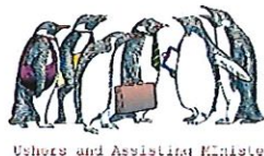
Ushers and Assisting Ministers