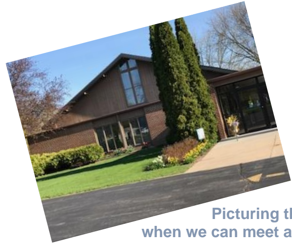
Picturing the day when we can meet again!

If you would like to make masks - there are many places that need your help and we thank you for your generosity. If you would like to make a few for St Andrew's eventually as a part of our hospitality when we return to worshipping and gathering in the building, we thank you for considering this. May God bless your generosity and thoughtfulness!