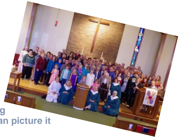
Hoping you can picture it too! Hang in there!