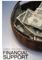
THANK YOU FOR YOUR FINANCIAL SUPPORT

If you can, please continue your financial support of St. Andrew's either through your bank's bill pay system, our on-line donations accessed through the website, or by mailing a check to St. Andrew's. We want to be sure that God's work is continued during and beyond this crisis for the sake of Oshkosh and the world. As one recent cartoon stated: Give today so that we are still here to baptize all the infants nine months from now!